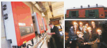
Location: UK National Coal Mining Museum Capacity: 51kW Inverter: 3 x GW17K-DT