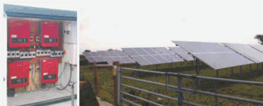
Location: Solar Farm, Gloucester, UK Capacity: 58kW Inverter: 4 x GW17K-DT