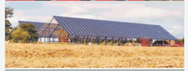
Location: Solar Farm, Denmark Capacity: 200kW Inverter: 11 x GW17K-DT